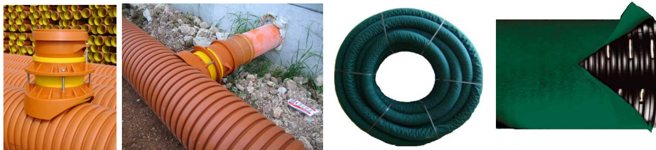
Above from the left: Simple Crown, coupling realized with Simple Crown, coil of Drenofilter, pipe detail: below: two images for Ecopozzo; Unomattina (RAI1) TV show with Ecopozzo in the studio, Ecopozzo pipes

In our stand you will appreciate also triple layer ecopozzo pipes for vertical perforations in HMPP, characterised by robustness, atoxicity, socket or threaded junction and resistance to high temperatures (it is not by chance that in addition to the realization of civil and industrial water wells, environmental remediation, pilots wells, cathodic protection systems, seismic tests , they are successfully employed in the captation of hot and very hot thermal waters ).