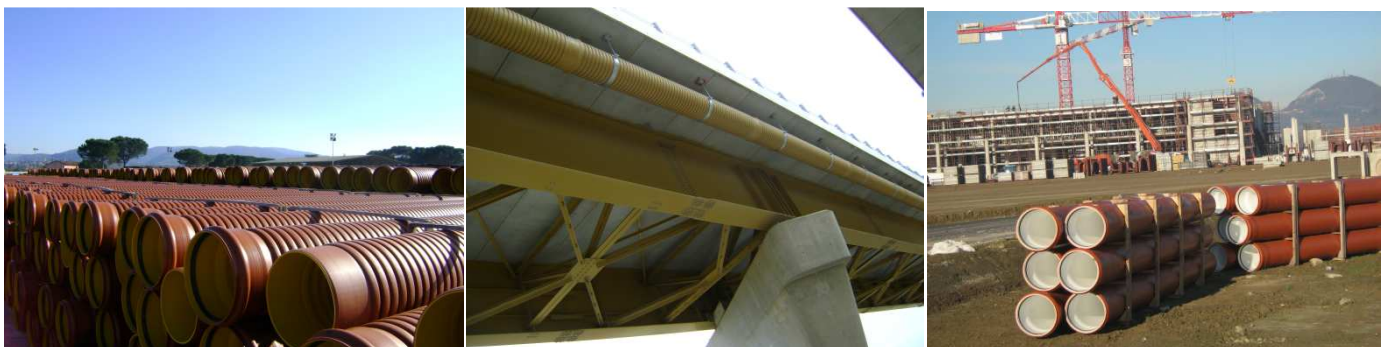
From the left: palletes of Kingcor, Kingcor employed for the disposal of meteoric waters from viaducts, TriPPlo+ in a worksite in Veneto. Both products have light inside wall in order to facilitate video inspections

During the Calabria Water Days 2014 , in our stand you will observe some of our product such as HMPP pipes for sewage systems (compact and triple-layer wall TriPPlo+ or double structured wall kingcor , both of them characterised by performances of extreme excellence along with lightness , total tightness junction, ease of installation, eco-friendliness ).